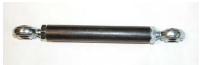
Correct- The rod ends are aligned.