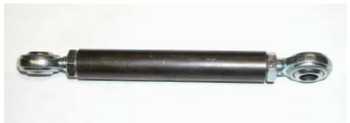
Incorrect- The rod ends are not aligned