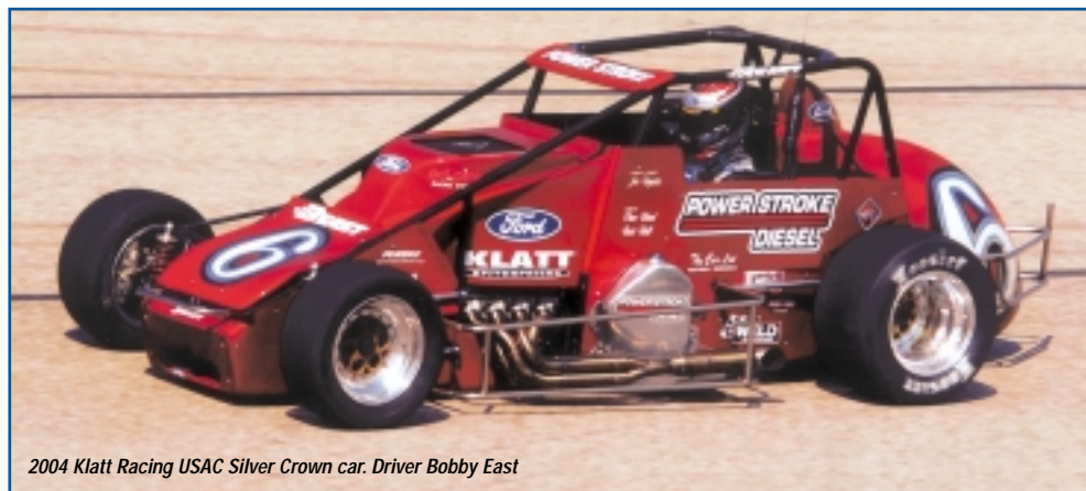
2004 Klatt Racing USAC Silver Crown car. Driver Bobby East

NOTE: Camshaft intake and exhaust valve events are measured at 0.050" tappet lift. The duration figures in the shaded area are taken at 0.050" tappet lift. This is useful to check the cam with a degree wheel during installation. The solid color is advertised duration. For comparison purposes, add intake and exhaust lobe centers and divide by 2 to calculate "camshaft centerline" specification for Ford Racing camshafts. Refer to appropriate engine section for additional details.