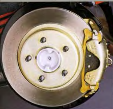
Four-wheel disc brakes with 5-lug bolt pattern

Road & Track Magazine describes the final result of these innovations as "Improved agility, a suspension that's firm but not excessively so, terrific ultimate grip and improved off-the-line acceleration."