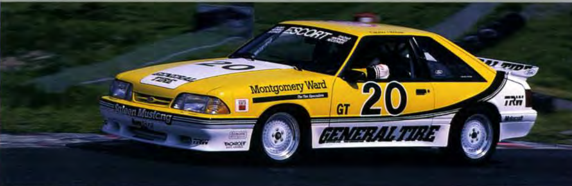
The winner of Ford's first ever victory in SS/GT class racing

The result of all this is not only functional, but, as Car & Driver put it, "The finished product looks like a take-no-prisoner street fighter."