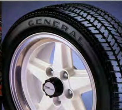
Ultra high performance 16" alloy wheels with VR rated General radial tires