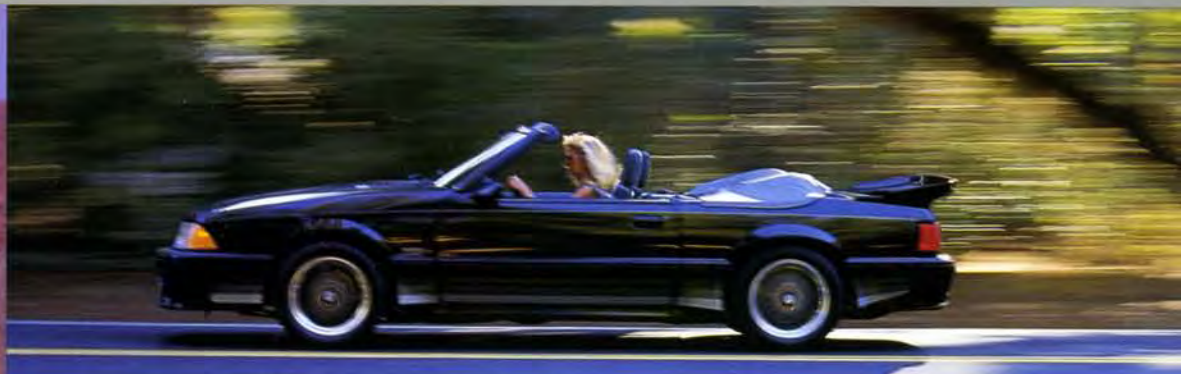
The Saleen Mustang Convertible opens a new dimension of driving.