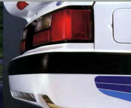
Rear wing and valance are aerodynamic and functional