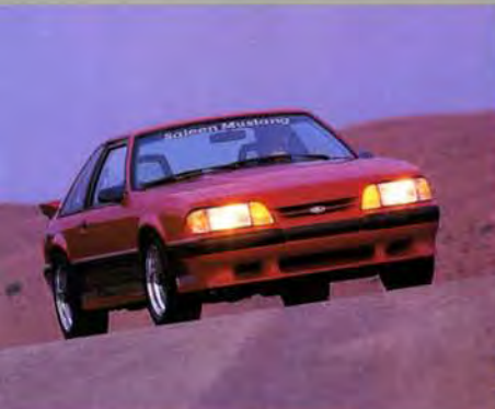
The powerful Saleen Mustang

behind it and is backed by a full Ford factory warranty. With this combination, as Autoweek Magazine so aptly puts it, "Crank it up, and what you have is a car that'll blow just about everything else into the weeds."