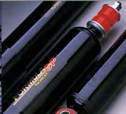
Suspension includes six gas pressurized shock absorbers