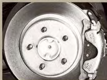
Four-wheel disc brakes with 5-lug bolt pattern

Parts and Accessories Available Individually Please Call: (619) 560-2040