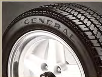
Ultra high performance 16" alloy wheels with VR rated General radial tires